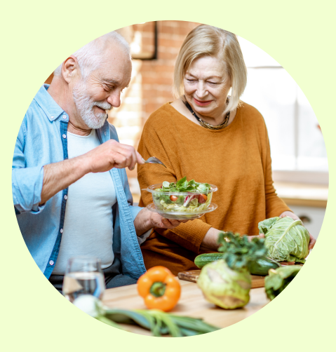
REST EASY KNOWING YOU'RE GETTING HEALTHY FOOD AT GREAT PRICES