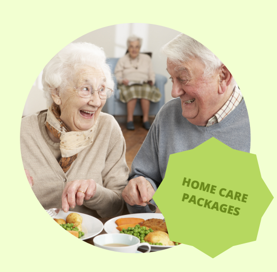
UP TO 70% OF YOUR COST COVERED BY YOUR HCP