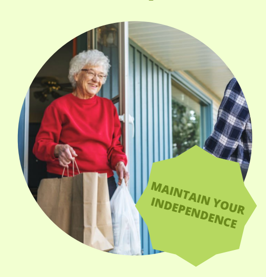
DELIVERED BY VALUABLE VOLUNTEERS

E: communitycare@warrumbungle.nsw.gov.au P: 02 6849 2200 / 02 6378 5130 Offices in Coonabarabran and Coolah Delivering across the Warrumbungle Shire