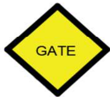
W5-14 Warning Sign