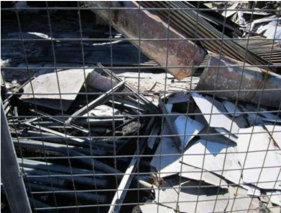
Figure 6 – Example of building collapsed due to structural fire damage. Collapsed ACM that has been reduced to a powder form or that can be crumbled or pulverised or reduced to a powder by hand pressure when dry is defined as friable asbestos.

All fire damaged asbestos removal works must be undertaken by an AS1 licensed asbestos removal contractors (refer to Appendix G).