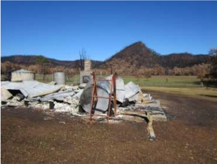
Figure 9 – Example of Fire Damaged property with Friable Asbestos and Soil to be removed

Where ACM contaminated soil is to remain in place, WSC notification will be required along with the management details.