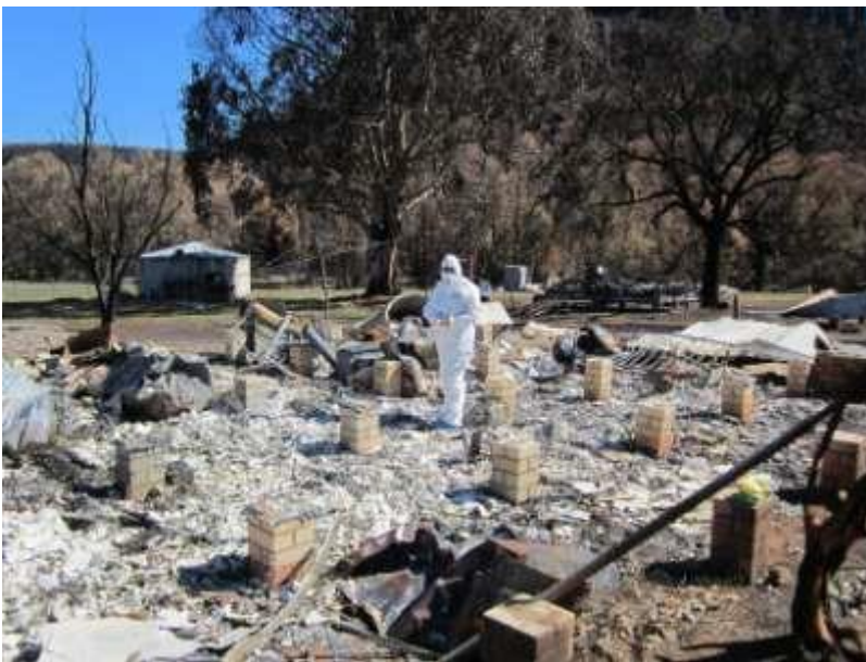
Figure 2 – Burned Down Building within the WSC Local Government Area

All Asbestos Containing Materials (ACMs) that has been damaged by fire is considered to be Friable under the WHS Regulation (see Figure 2)