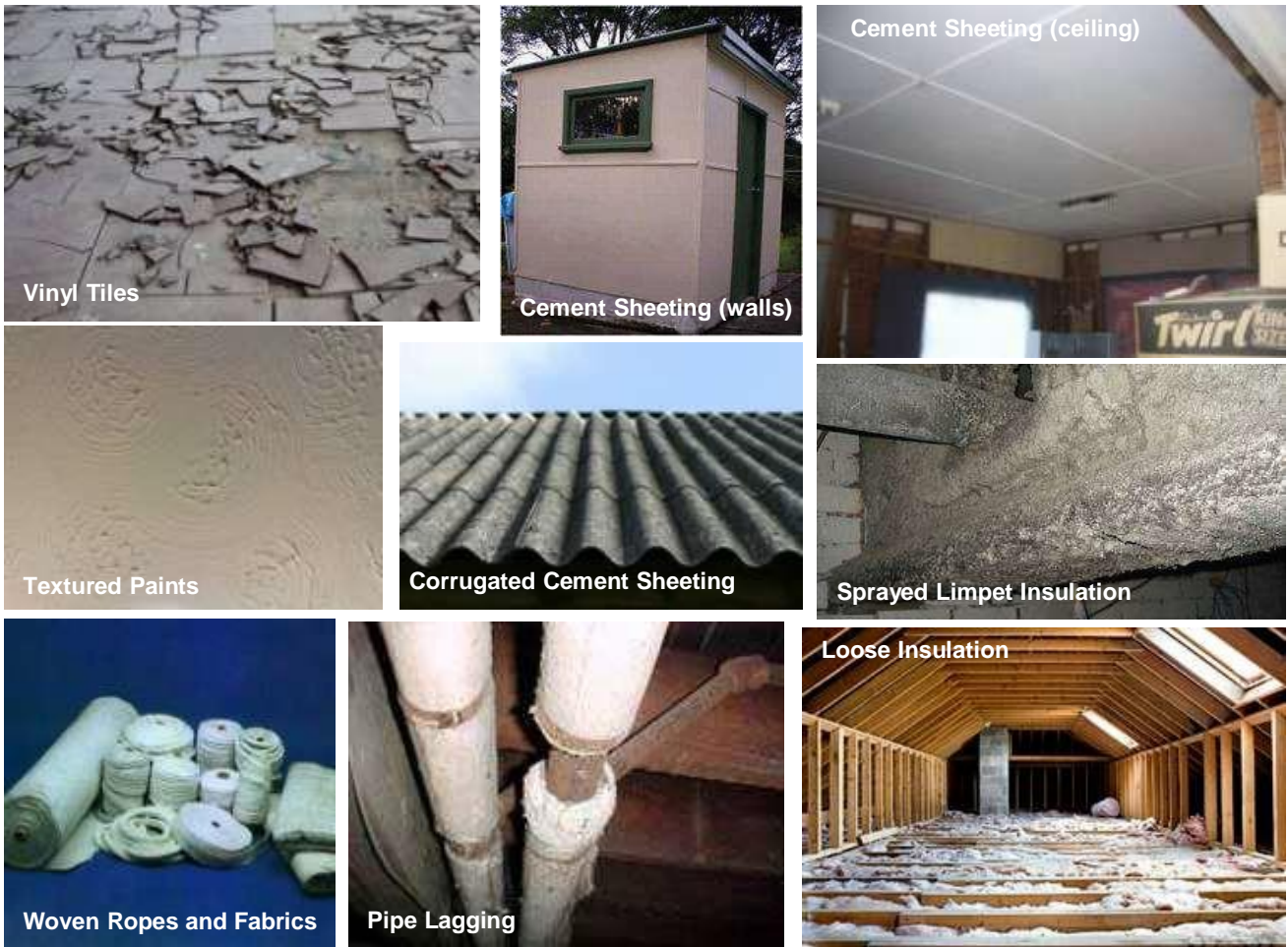
Figure 4 – Typical Asbestos Containing Materials (ACMs) from Bonded Vinyl Tiles to Friable Insulation