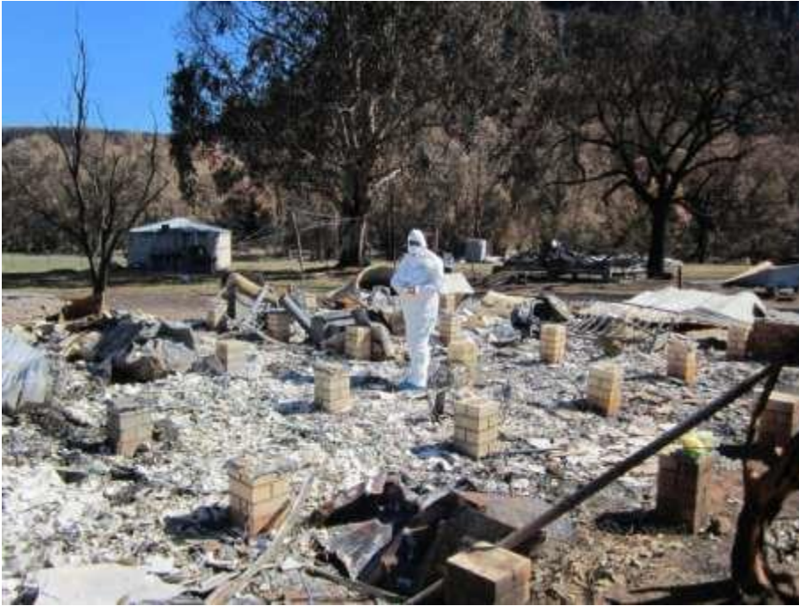
Figure 7 – Example of Fire Damaged Asbestos Cement that is considered friable asbestos.