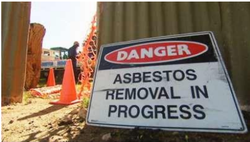
Figure 8 – Specified Asbestos Removal Signage

The following mitigation measures will be applied for the management of asbestos removal work at all WSC Local Governmental Area properties: